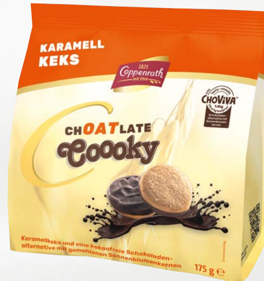
chOATlate Cooooky Caramel