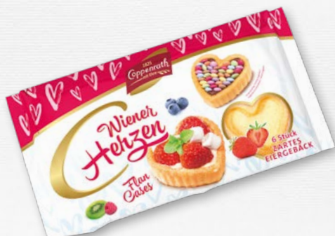
Wiener Torteletts Hearts