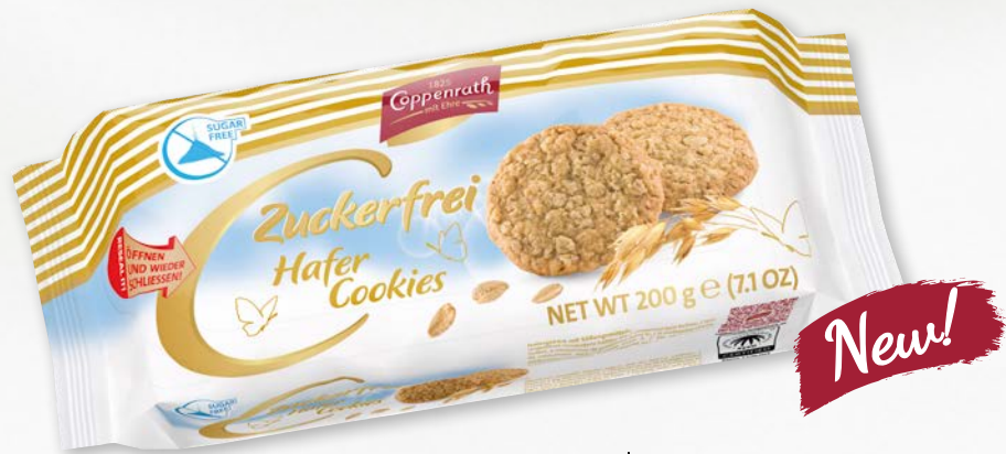
Sugar free Hafer Cookies