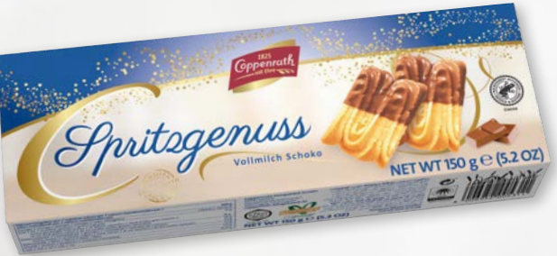
Spritzgenuss Milk chocolate