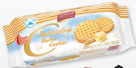
Sugar free Butter Cookies