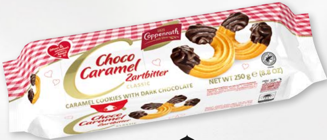
Choco Caramel Dark chocolate