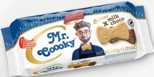
Mr. Cooooky Milk choco