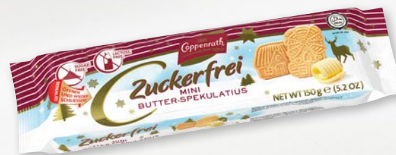
Sugar free Mini Butter-Spekulatius