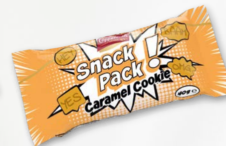
Snack Pack Caramel Cookie