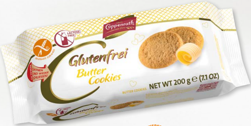
Gluten free Butter Cookies