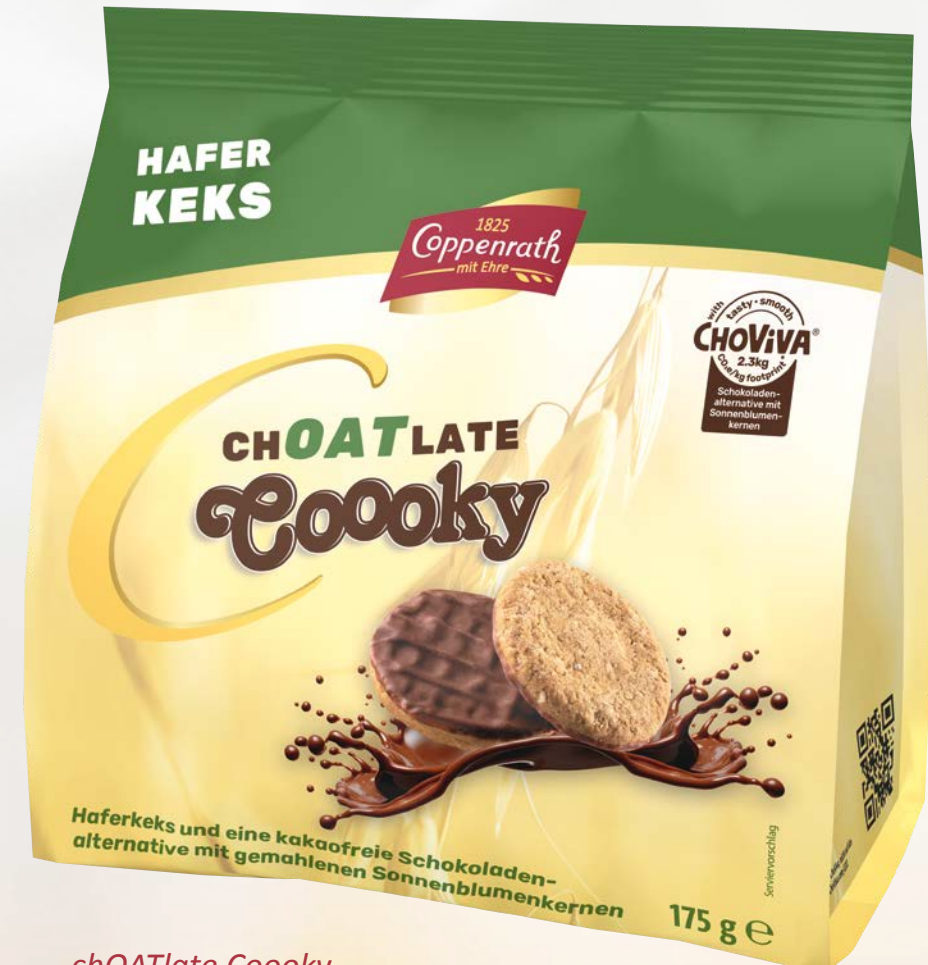
chOATlate Cooooky Oat