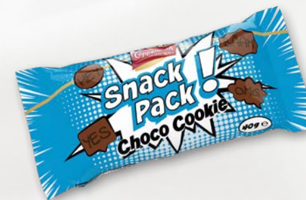
Snack Pack Choco Cookie