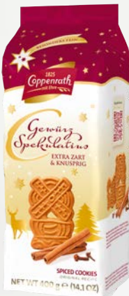
Spiced Speculatius 400 g