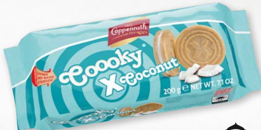
Cooooky x Coconut