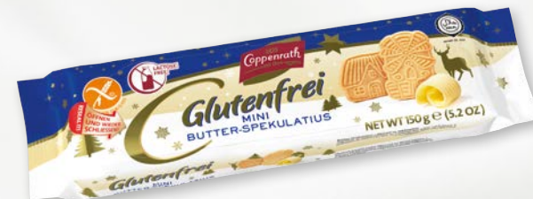
Gluten free Mini Butter-Spekulatius