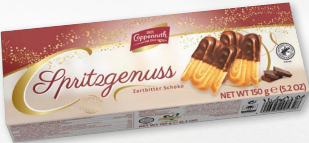
Spritzgenuss Dark chocolate