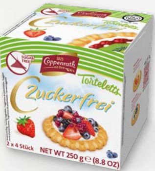
Mürbe-Spritz-Torteletts Sugar free