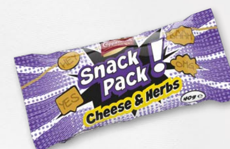
Snack Pack Cheese & Herbs