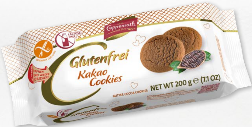
Gluten free Kakao Cookies