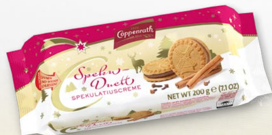
Speku-Duett Speculoos cream