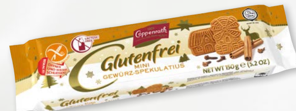
Gluten free Mini Spiced-Spekulatius