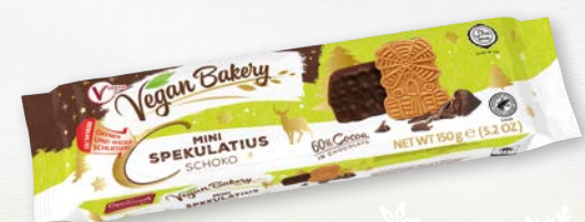
Vegan Bakery Mini Chocolate Spekulatius