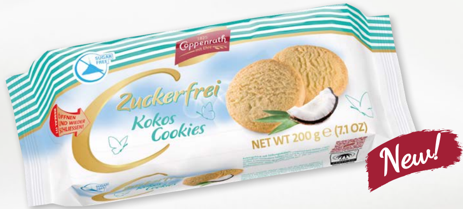
Sugar free Kokos Cookies

Live consciously and still enjoy yourself – our sugar-free baked biscuits prove that a full and crispy taste experience is also possible without the use of sugar. Just try them and enjoy!