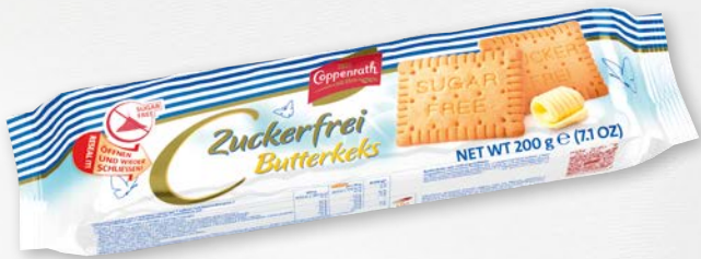
Sugar free Butterkeks