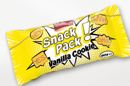
Snack Pack Vanilla Cookie