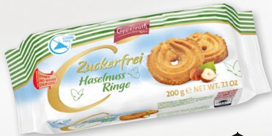
Sugar free Haselnuss Ringe