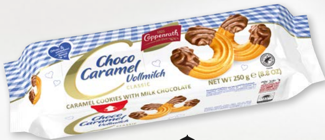
Choco Caramel Milk chocolate