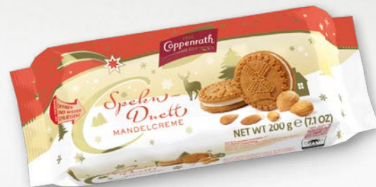
Speku-Duett Almond cream