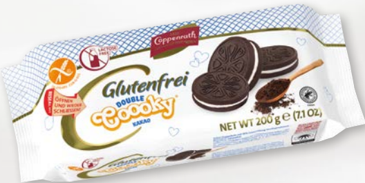
Double Cooky Cocoa