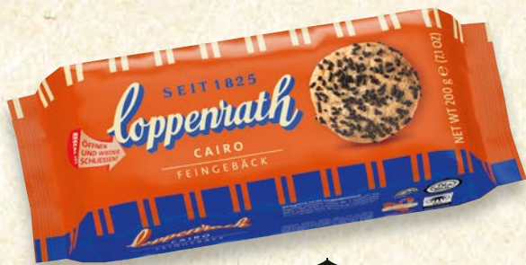
Cairo Biscuits with chocolate sprinkles

The products in our fine pastry range perfectly embody the values of the Coppenrath brand: quality, tradition and sustainability.