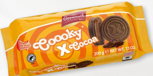
Cooooky x Cocoa