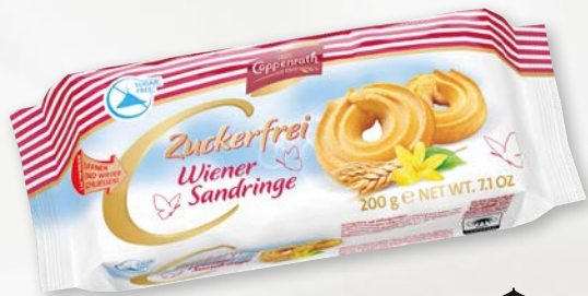
Sugar free Wiener Sandringe