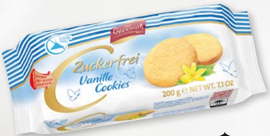
Sugar free Vanille Cookies