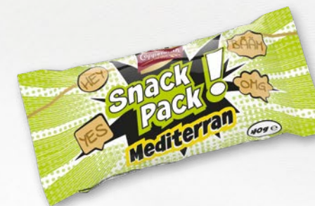
Snack Pack Mediterran