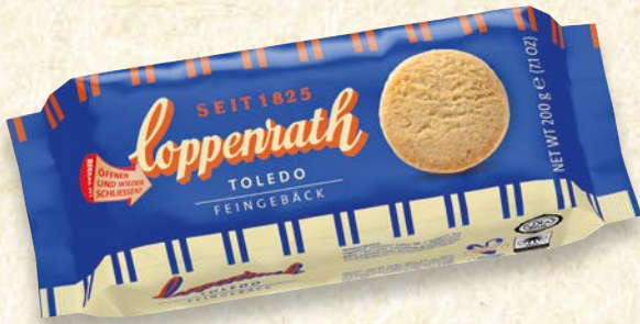
Toledo Hazelnut biscuits