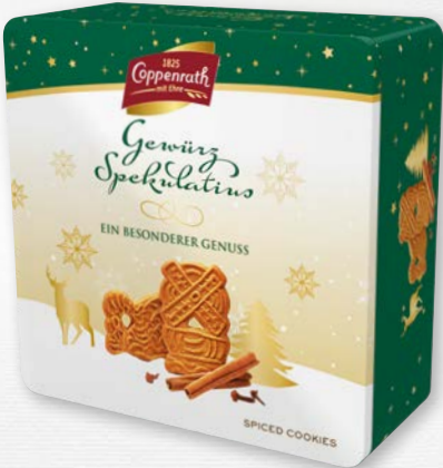
Spiced Speculatius Tin 1 kg