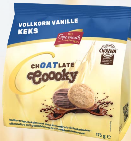
chOATlate Cooooky Whole grain vanilla