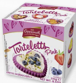
Mürbe-Torteletts Hearts Pink