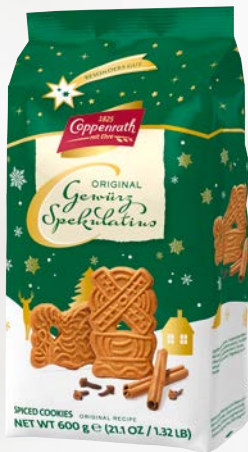
Spiced Speculatius 600 g