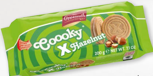
Cooooky x Hazelnut