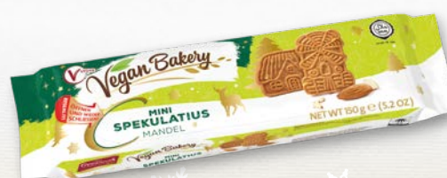
Vegan Bakery Mini Almond Spekulatius