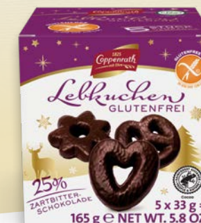
Gluten free Gingerbread