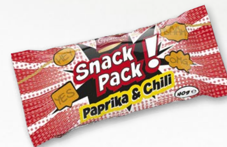
Snack Pack Paprika & Chili