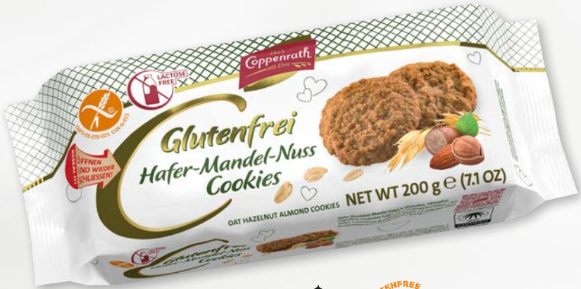
Gluten free Oat, almond and nut Cookies

Thanks to special recipes, we offer you an incomparable taste experience that is not only suitable for people with gluten intolerance, but also for anyone who values a conscious diet. Treat yourself to delicious moments, completely gluten-free.