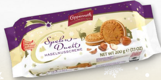
Speku-Duett Hazelnut cream