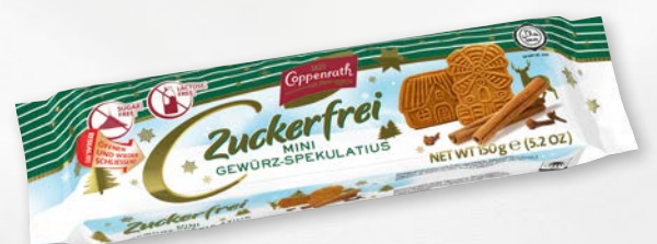
Sugar free Mini Spiced-Spekulatius