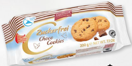
Sugar free Choco Cookies