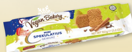
Vegan Bakery Mini Spiced Spekulatius