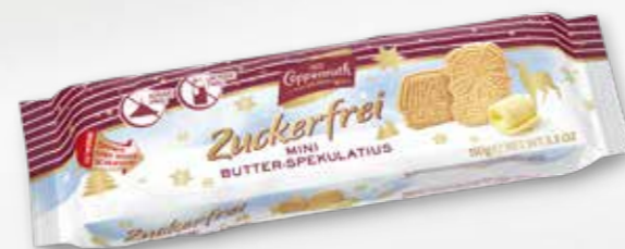
Sugar free Mini Butter-Spekulatius