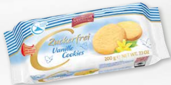
Sugar free Vanille Cookies