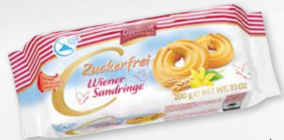
Sugar free Wiener Sandringe