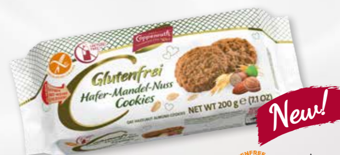
Gluten free Hafer-Mandel-Nuss Cookies