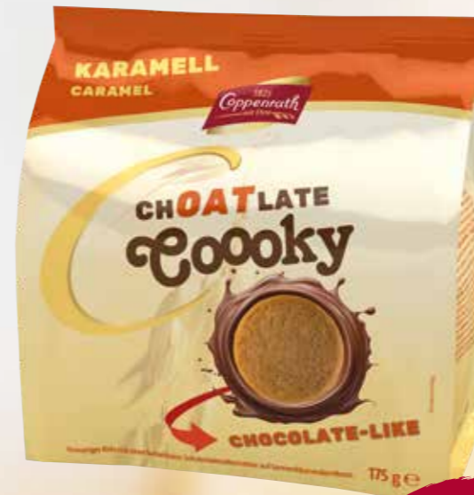
chOATlate Cooky Caramel