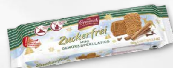
Sugar free Mini Spiced-Spekulatius