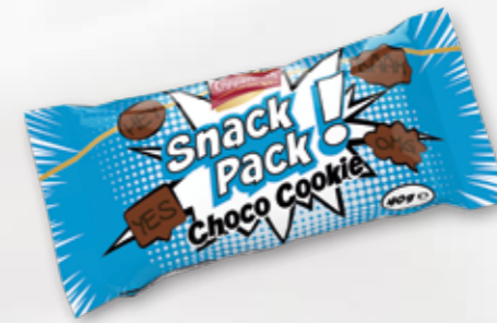
Snack Pack Choco Cookie