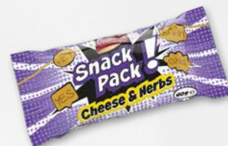
Snack Pack Cheese & Herbs