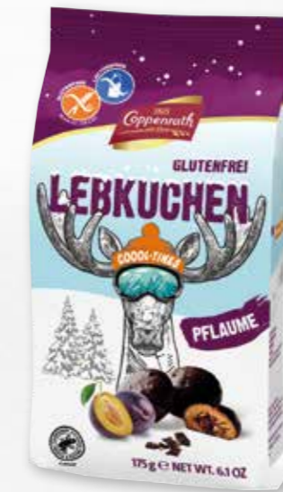
Gluten free Gingerbread with plum filling