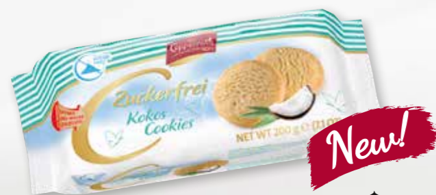
Sugar free Kokos Cookies