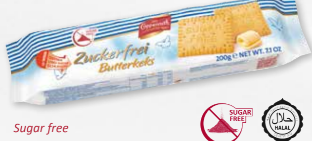
Sugar free Butterkeks (Shortbread)