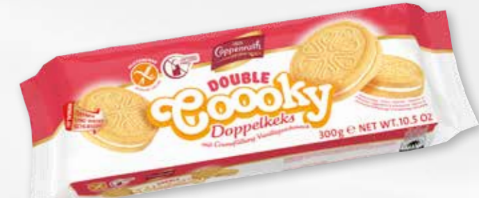
Double Cooky Vanilla