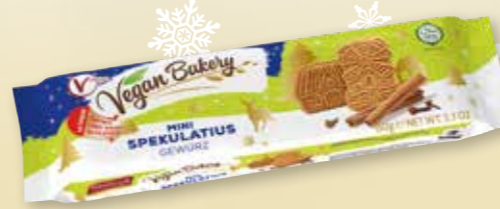
Vegan Bakery Mini Spiced Spekulatius