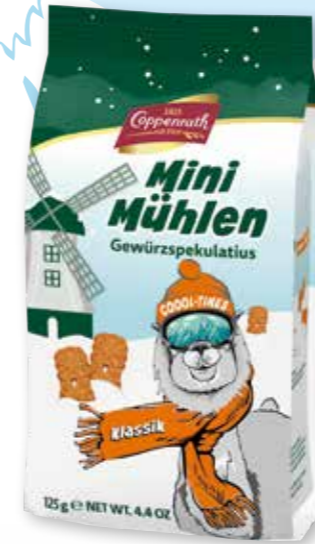
Mini Windmill Spekulatius Classic