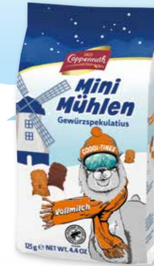
Mini Windmill Spekulatius Milk chocolate