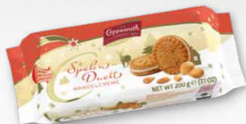
Speku-Duett Almond cream