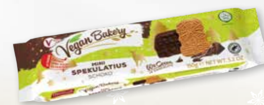
Vegan Bakery Mini Chocolate Spekulatius