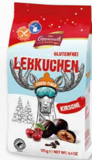
Gluten free Gingerbread with cherry filling