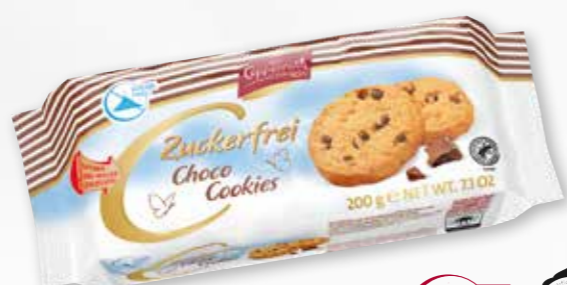
Sugar free Choco Cookies