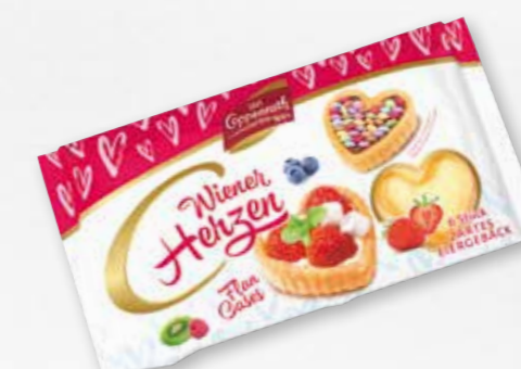
Wiener Torteletts, Herzen Hearts