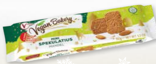
Vegan Bakery Mini Almond Spekulatius