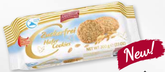
Sugar free Hafer Cookies