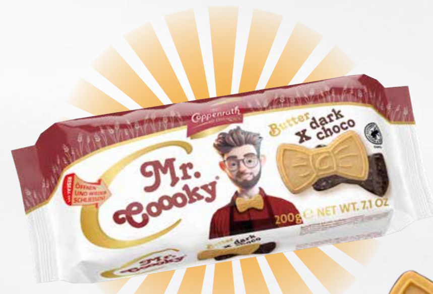
Mr. Cooky Dark chocolate