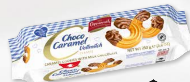
Choco Caramel Milk chocolate