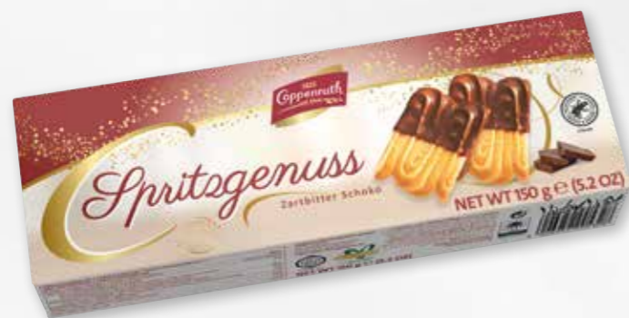
Spritzgenuss Dark chocolate