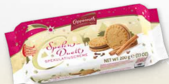
Speku-Duett Speculoos cream