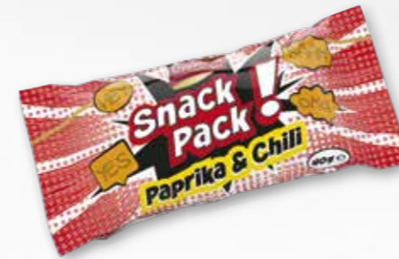
Snack Pack Paprika & Chili