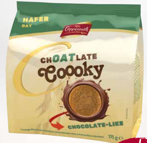
chOATlate Cooky Oat