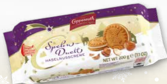
Speku-Duett Hazelnut cream