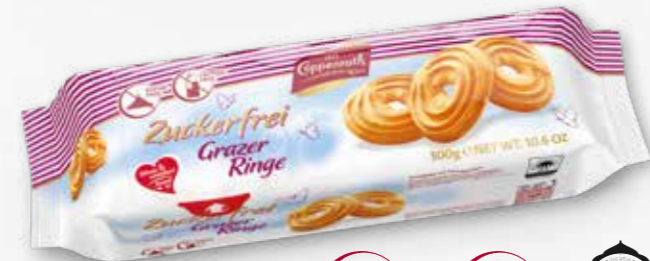
Sugar free Grazer Ringe