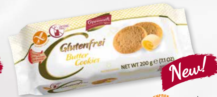
Gluten free Butter Cookies