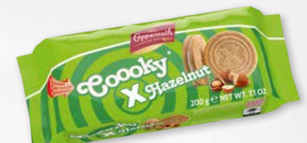
Cookie x Hazelnut