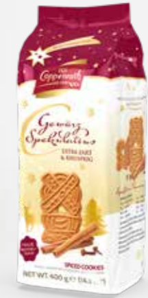
Spiced Speculatius 400 g