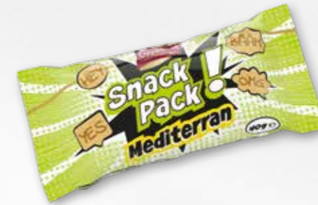
Snack Pack Mediterran