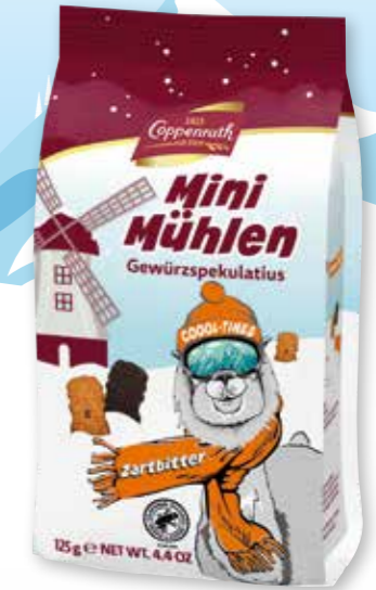
Mini Windmill Spekulatius Dark chocolate