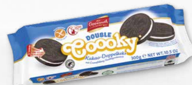
Double Cooky Cocoa