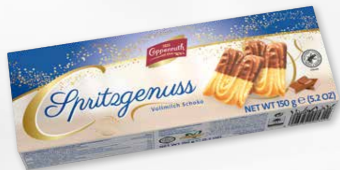
Spritzgenuss Milk chocolate