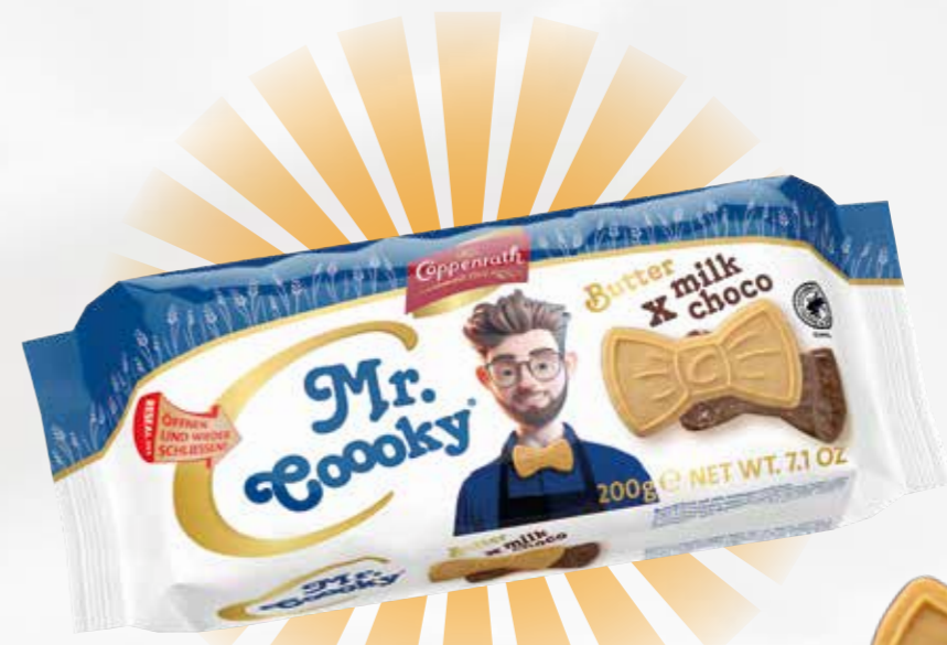
Mr. Cooky Milk chocolate

ÖFFNEN UND WIEDER SCHLIESSEN! RESEAL IT!