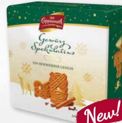
Spiced Speculatius Tin 1 kg