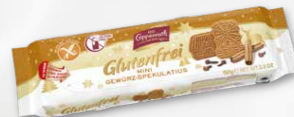
Gluten free Mini Spiced-Spekulatius