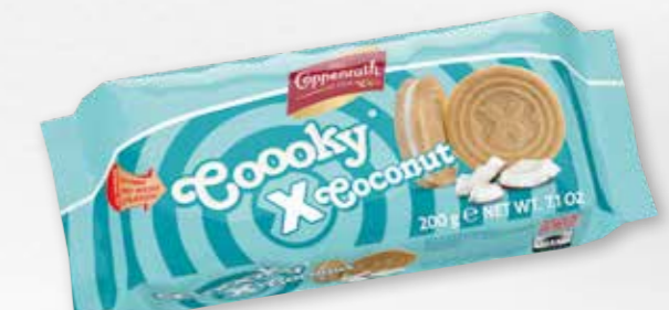
Cookie x Coconut