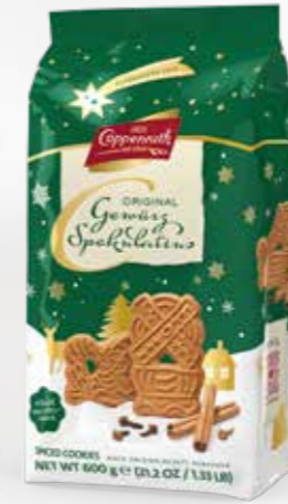
Spiced Speculatius 600 g