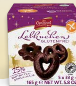
Gluten free Gingerbread