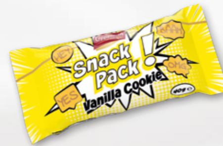
Snack Pack Vanilla Cookie