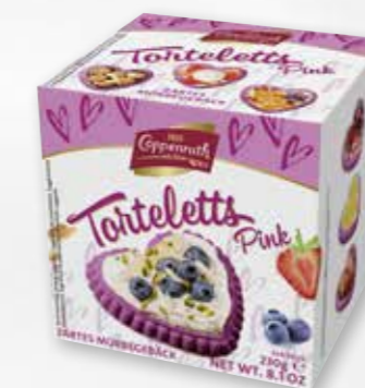
Mürbe-Torteletts, Herz Hearts pink