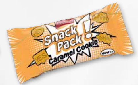
Snack Pack Caramel Cookie