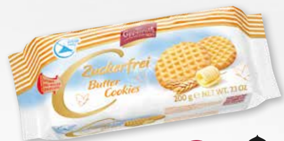
Sugar free Butter Cookies