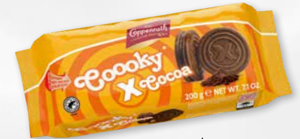
Cookie x Cocoa