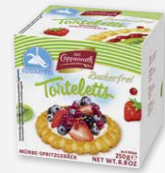
Mürbe-Spritz-Torteletts Sugar free