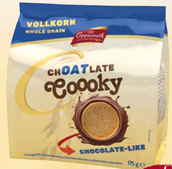
chOATlate Cooky Whole Grain