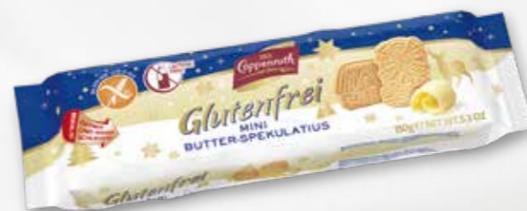
Gluten free Mini Butter-Spekulatius