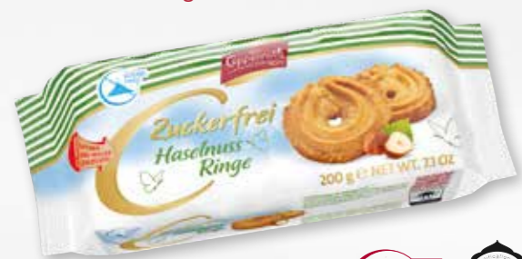
Sugar free Haselnuss Ringe