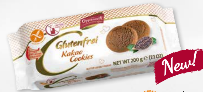
Gluten free Kakao Cookies