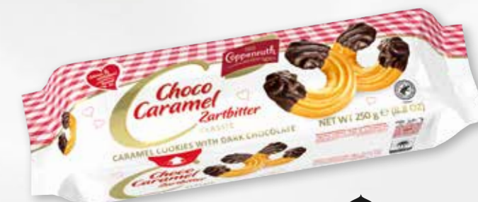
Choco Caramel Dark chocolate