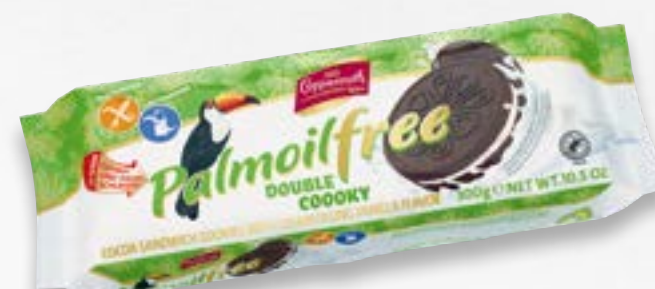
Palmoilfree Double Coooky