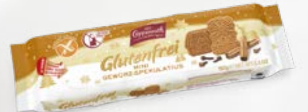
Glutenfrei Mini Gewürz-Spekulatius