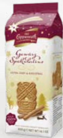
Spiced Spekulatius 400 g