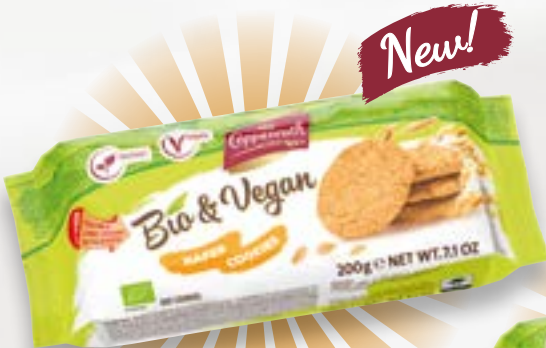
Organic & Vegan Oat Cookies