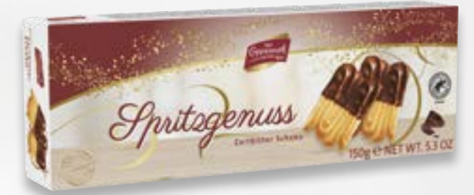
Spritzgenuss Dark chocolate