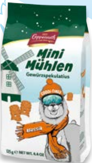
Mini Windmill Spekulatius Classic