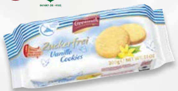
Sugarfree Vanille Cookies