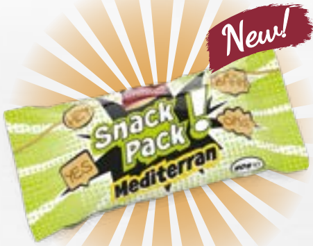
Snack Pack Mediterran