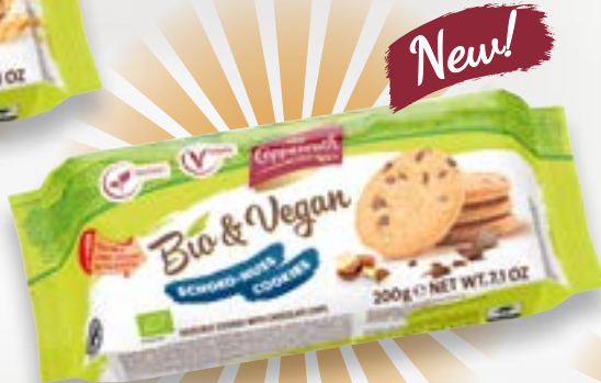
Organic & Vegan Chocolate-Nut Cookies