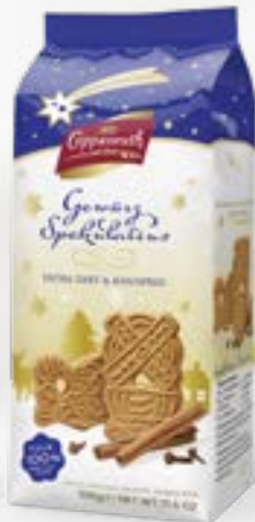
Spiced Spekulatius 500 g