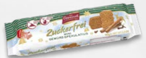
Sugarfree Mini Gewürz-Spekulatius