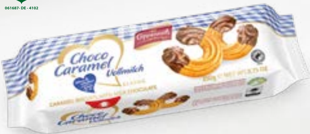
Choco Caramel Milk chocolate