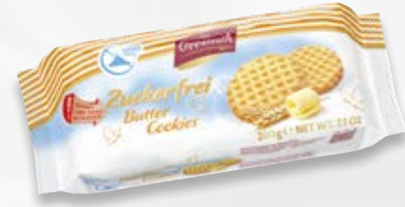
Sugarfree Butter Cookies