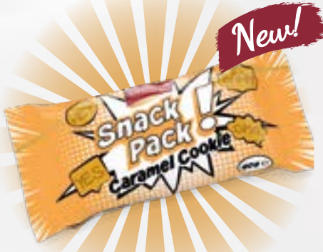
Snack Pack Caramel Cookie