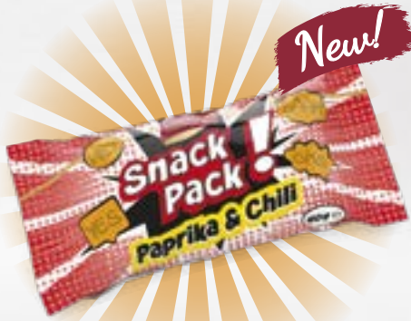
Snack Pack Paprika & Chili