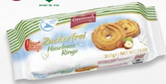
Sugarfree Haselnuss Ringe