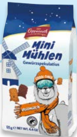
Mini Windmill Spekulatius Milk chocolate