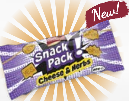
Snack Pack Cheese & Herbs