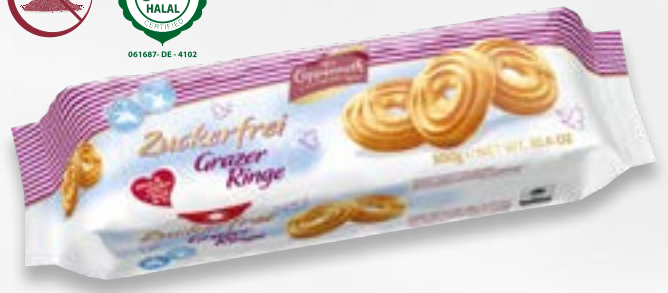
Sugarfree Grazer Ringe