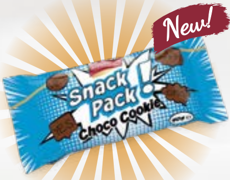
Snack Pack Chocolate Cookie