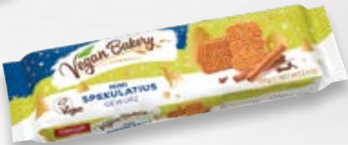
Vegan Bakery Mini Spiced Spekulatius