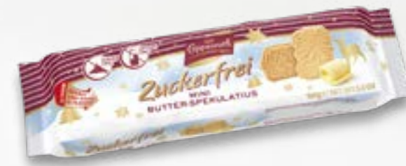
Sugarfree Mini Butter-Spekulatius