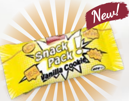
Snack Pack Vanilla Cookie