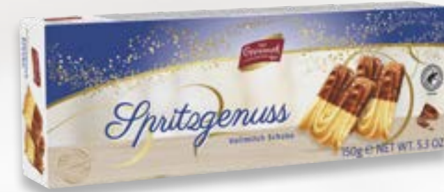
Spritzgenuss Milk chocolate