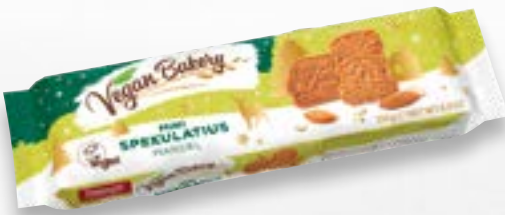
Vegan Bakery Mini Almond Spekulatius