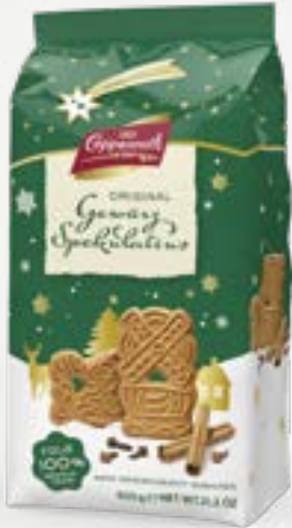
Spiced Spekulatius 600 g