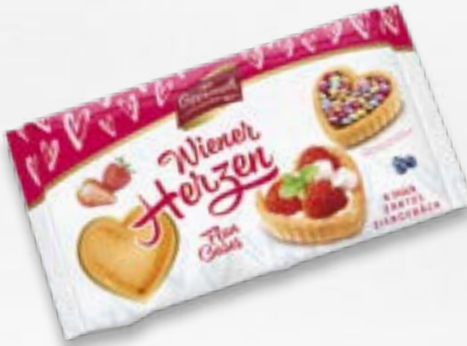
Wiener Torteletts Hearts