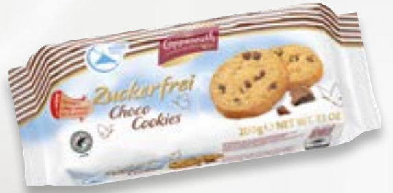
Sugarfree Choco Cookies