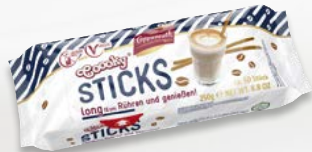
Coooky Sticks, long