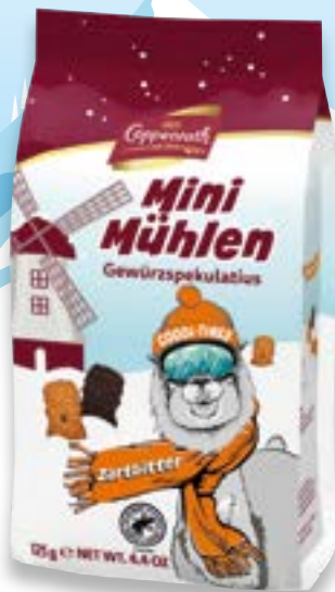
Mini Windmill Spekulatius Dark chocolate