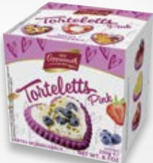
Mürbe-Torteletts Hearts Pink