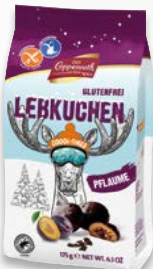
Glutenfree Gingerbread with Plum-filling