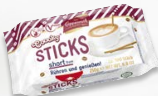
Coooky Sticks, short