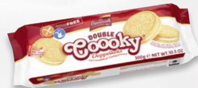
Double Coooky Vanilla