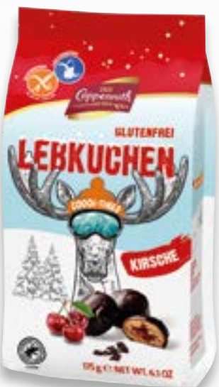
Glutenfree Gingerbread with Cherry-filling