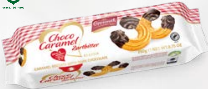
Choco Caramel Dark chocolate