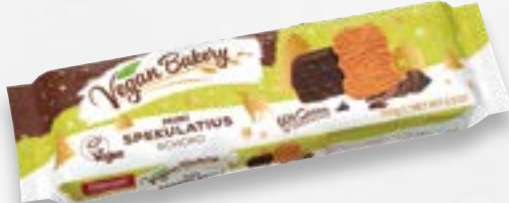
Vegan Bakery Mini Chocolate Spekulatius