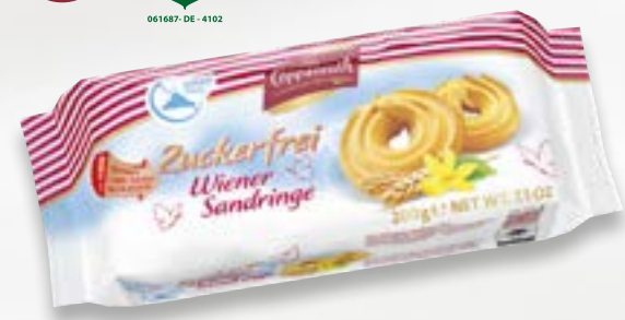
Sugarfree Wiener Sandringe