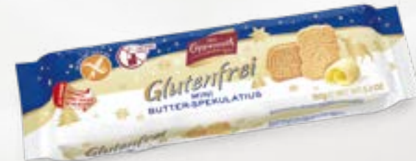
Glutenfrei Mini Butter-Spekulatius