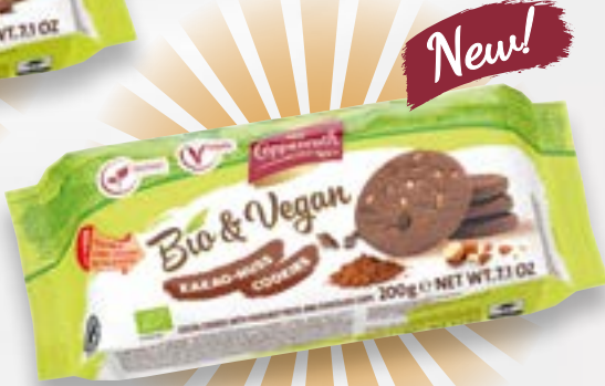
Organic & Vegan Cocoa-Nut Cookies