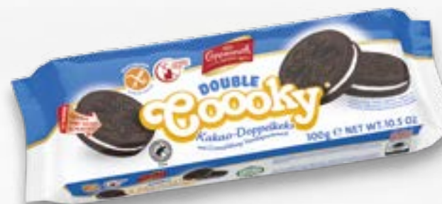
Double Coooky Cocoa